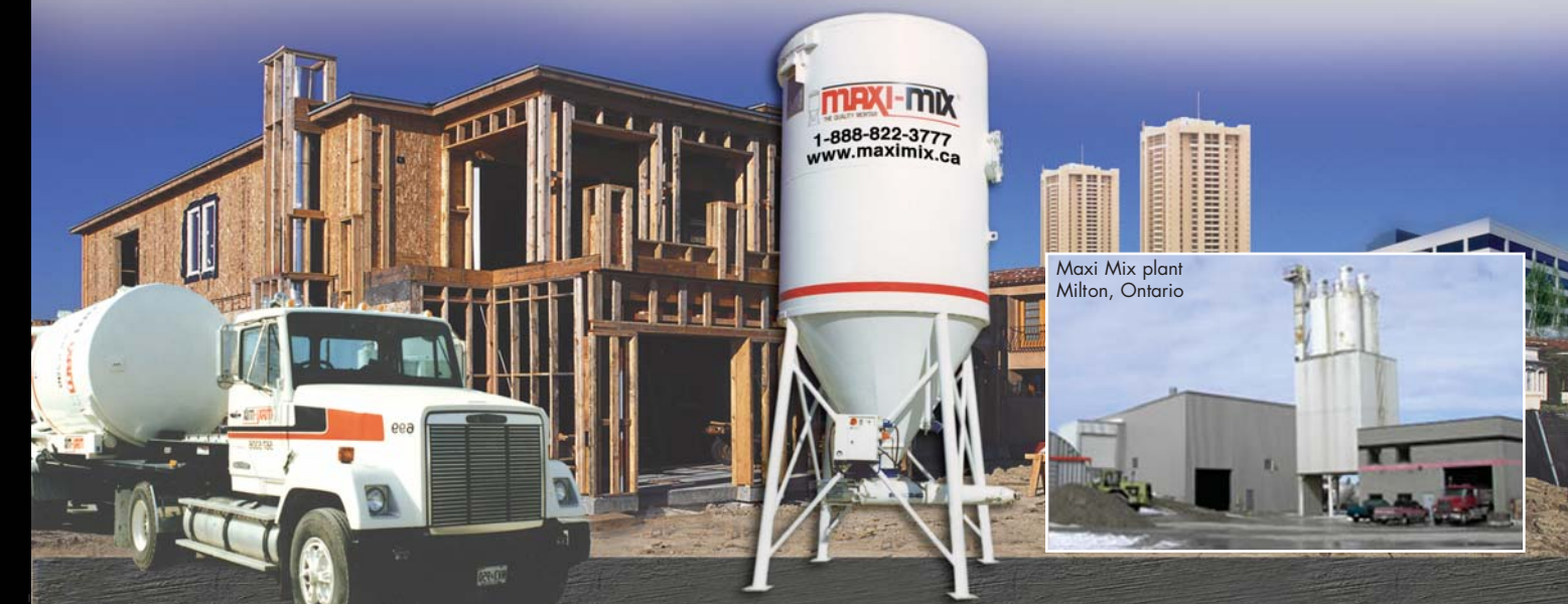
Maxi Mix plant Milton, Ontario