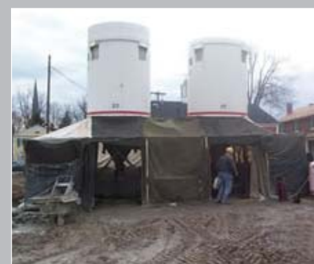
Winter silo enclosure

Our extreme quality control is your guarantee of consistent results. Find out today how you can have it made with Maxi-Mix!