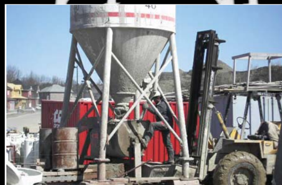
Our Maxi-Mix Silo can also be elevated, allowing masons to use their own mortar mixers!